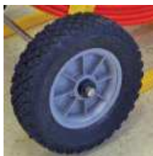
All Terrain Wheel